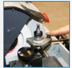
Device for rocker arm grinding