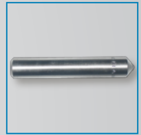
Diamond and rest