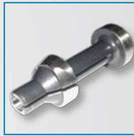
Collet for short valves from 4 to 9 mm