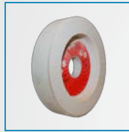
Cup grinding wheel