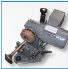
Device for grinding valve