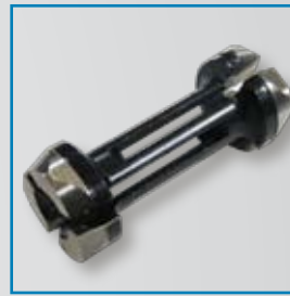
Collet for short valves from 9 to 12 mm